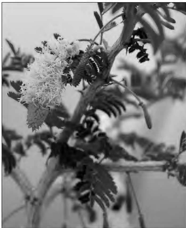
Aroma (Dichrostachys cinerea subspecies africana) is readily available in the international, national, and local trade. It is touted on the Web as an interesting specimen for the landscape, and an appealing bonsai species. Photo by C. Jacono, March 2010. See article on page 3 of this issue.

University of Florida Institute of Food and Agricultural Sciences Center for Aquatic and Invasive Plants (CAIP) 7922 N.W. 71st Street, Gainesville, FL 32653-3071 USA CAIP-website@ufl.edu • http://plants.ifas.ufl.edu